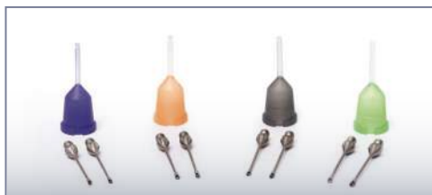
EVA EQUIPHACO™ Next-generation EVA phaco technology

Designed for superior AC stability, improved ultrasound efficiency and reduced effective phaco time.