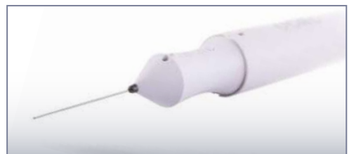
DORC TDC Two-dimensional cutter for efficient vitrectomy

Designed for superior AC stability, improved ultrasound efficiency and reduced effective phaco time.