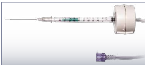
EVA INICIO™ First approved ophthalmic microinjection system

Engineered for enhanced rigidity and optimal performance – perfectly complemented by the Vacuflow VTi fluidics.